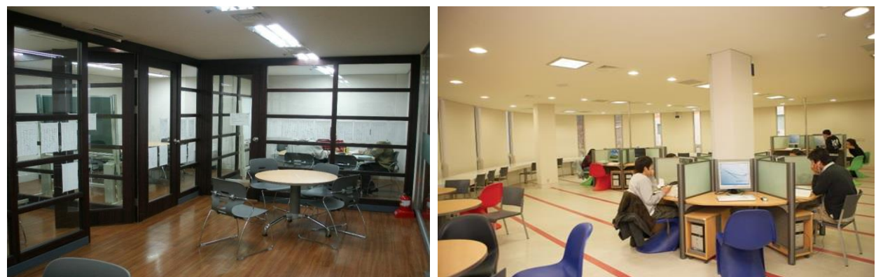
<Seminar Room and Internet Café>