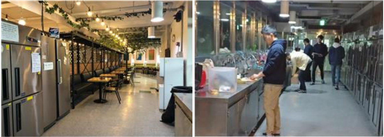
<Community Kitchen & Cafeteria>

The Dormitory and International House provides coin-operated laundry rooms and a gym for its residents' use. These are located on the basement floor and open 24 hours. Seminar rooms, student lounges, and an internet café are also available for the residents.