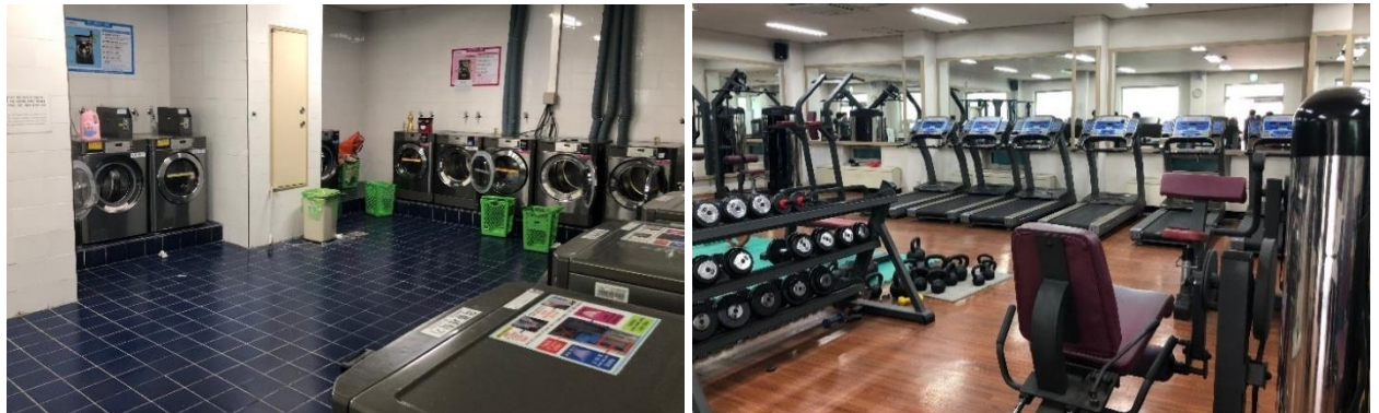
<Laundry Room and Gym>

The Dormitory and International House provides coin-operated laundry rooms and a gym for its residents' use. These are located on the basement floor and open 24 hours. Seminar rooms, student lounges, and an internet café are also available for the residents.