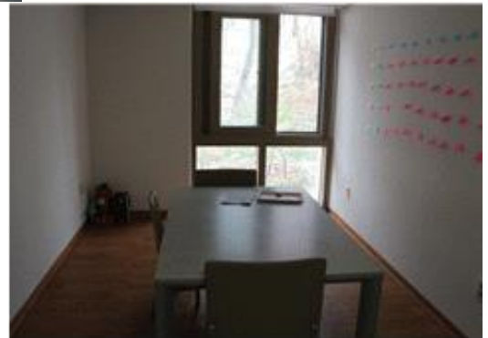
<Rooms in the International House>

All rooms are fully equipped with central heating, central air conditioning and free LAN internet access. Each occupant will use a single room but share a living room, shower room, toilet and laundry. The rooms are centrally air-conditioned but students can set the room temperature using the control switch. The electric voltage in Korea is 220V (60hz), and the standards wall socket has two rounded holes. Due to fire hazard reasons, the use of cooker, iron or coffeepot is strictly prohibited in the room. The International House has a community kitchen for students to cook their own food occasionally. Many international students use this community kitchen to cook their own ethnic food and share it with other international or Korean students.